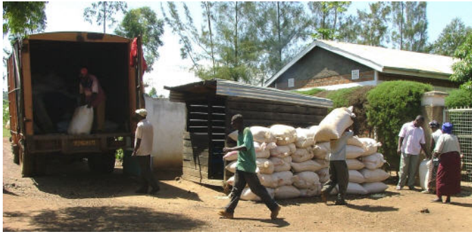
Unloading another maize delivery

During one of our trustee meetings in January I expressed my concern about the needs of our local community. We know that April is always a tough time for our neighbours because the food from the small crop harvested in December or January is always exhausted months before the next main crop is harvested at the end of June. This year, the drought that was widely reported to be happening in North Eastern Kenya also hit our friends in this semi-arid corner of South Western Kenya. We all agreed that it was important to do something to help our most desperate neighbours, (even though we are still committed to raising the next installment of £8000 towards the purchase of our children's home and school).