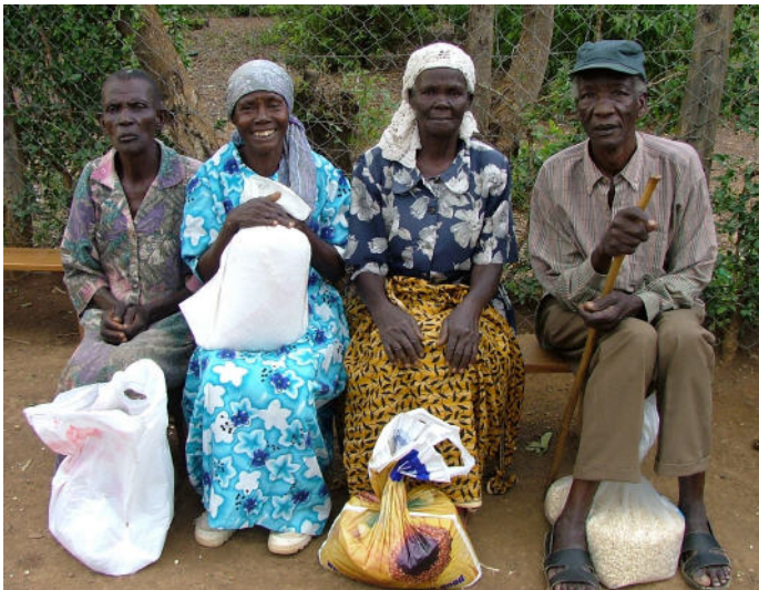
How could you turn them away to go hungry? The elderly often go without because they have no one to look out for them.