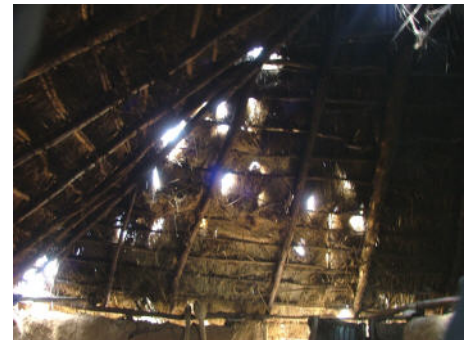
Holes in the roof - where the rain gets in.