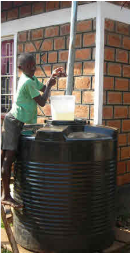
It's hard work! - Fetching, carrying and washing

Across Africa getting enough water for the day is a persistent challenge. The pictures on this page show the water challenge is something we have to take seriously at Hope and Kindness. As we have reported before our principle supply of water for drinking and cooking is a tap in Oyugis, (our nearest "town"). We rely on a very old tractor filling up with water at the tap then pulling an even older water bowser the 7 kilometres to our place to fill the main water tank. It's a miracle every time it happens. We have experienced weeks when the tractor didn't make it. On one memorable occasion the bowser lost a wheel on the way back to Oyugis and our security team had to guard it overnight.